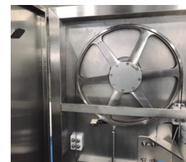
Automatically adjusts the tension of the blade and also has a load detection function