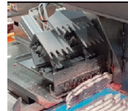
Counter plate pushes the remaining meat for a final slice to minimize the thickness of residual meat down to 15mm