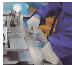
Safety-conscious two- hand push switch