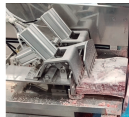
Proprietary two-step chucking mechanism