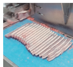
Unique conveyor control enables shingles discharge